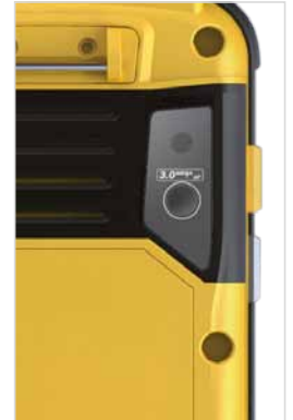
3.0 MP colour Camera with auto focus incl. flash