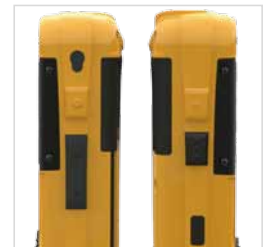
RS-232 Interface & Volume controller