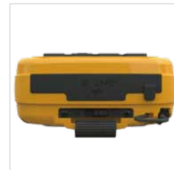
IC Card Slot & Device-lock