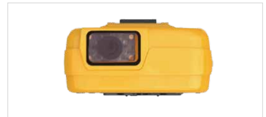
2D CMOS Engine imager